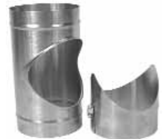
2 pc. Base Tee - No Cap