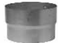
Direct Connect Connector