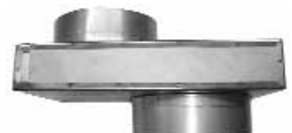
Adjustable Offset Box