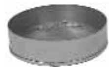
Base Tee Cap